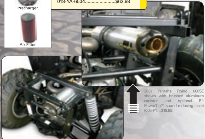
2007 Yamaha Rhino 660SE shown with brushed aluminum canister and optional P1 Powertip™ sound reducing insert (005-P1.....$19.98)