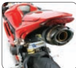
2006 Triumph Daytona 675 showing fender eliminator & P1-R sound suppressor