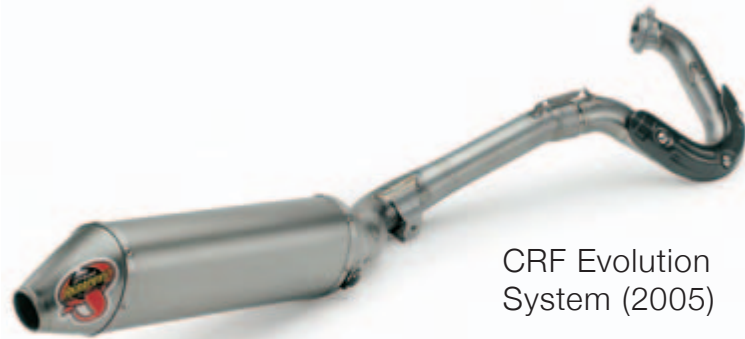
CRF Evolution System (2005)

The production series of this revolutionary exhaust comes in two varieties: a standard version for all-around performance and a longer-headpiped, high-torque version for superior low-end power; also for 2006 a dual muffler.