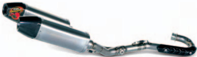
CRF Evolution System (2006)